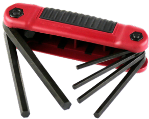
6 Hex Key Wrench Cluster | MT-TK-HX-00-0-SAE

Material: Heat treated chrome vanadium steel Finish: Chrome plated mirror polish Size: 3/4" (9.5" x 1.5" x .5")