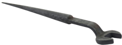
15/16" Spud Wrench | MT-TK-SW-10-0-SAE Material: Heat treated steel Finish: Black-Oxide Size: Bolt Size: 5/8" Top Diameter: 2-1/4" Point Diameter: 7/8" to 3/16" Length: 14-3/4"