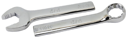
15/16" Combination Wrench (Halved) | MT-TK-CW-10-0-SAE Material: Heat treated chrome vanadium steel Finish: Chrome plated mirror polish Size: 15/16" (2.5" x 15" x 1") Size: 12" x 7" x 8"