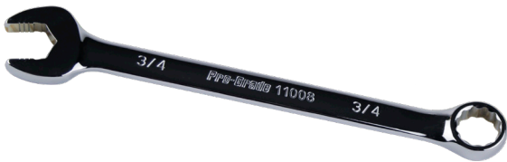
3/4" Combination Wrench | MT-TK-CW-07-0-SAE

Material: Heat treated chrome vanadium steel Finish: Chrome plated mirror polish Size: 15/16" (2.5" x 15" x 1") Size: 12" x 7" x 8"