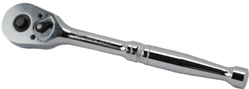
1/2" Drive Quick Release Oval Head Ratchet | MT-TK-RT-00-2-UNI Material: Heat treated chrome vanadium steel Finish: Chrome plated mirror polish Size: Handle 7.5" Long (2.3" x 11.5" x 1.5")