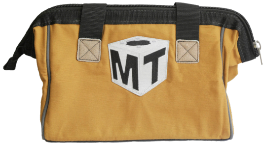
ModTruss 12" Work Bag | MT-TK-WB-12-07-08 Material: Durable fabric and heavy duty webbing handles with leather reinforcements Color: Brown Duck Size: 12" x 7" x 8"