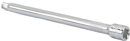
1/2" Drive Extension | MT-TK-EX-00-2-UNI Material: Heat treated chrome vanadium steel Finish: Chrome plated Size: 10" Long (1.75" x 12.25" x .75")