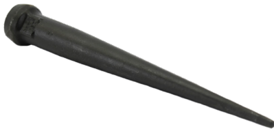
1-1/16" Broad-Head Bull Pin | MT-TK-BP-00-0-UNI Material: Heat treated steel Finish: Black-Oxide Size: Top Diameter: 1-1/16" Point Diameter: 1/4" Length: 10"