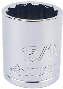
15/16" Standard Socket, 12-Point (1/2" Drive) | MT-TK-SS-10-2-SAE

Material: Heat treated chrome vanadium steel Finish: Chrome plated Size: 15/16" (1.75" x 5.5" x 1.25")