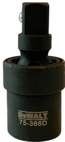
1/2" Drive Universal Joint | MT-TK-UJ-00-2-UNI

Material: Alloy Steel and Plastic Handle Hex Key Sizes Included: 5/32" | 3/16" | 7/32" | 1/4" | 5/16" | 3/8" Overall Size: 5.5" x 1.75" x 1.5"