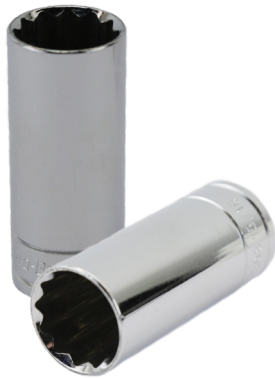
15/16" Deep Socket, 12-Point (1/2" Drive) | MT-TK-DS-10-2-SAE

Material: Heat treated chrome vanadium steel Finish: Chrome plated Size: 15/16" (1.75" x 5.5" x 1.25")